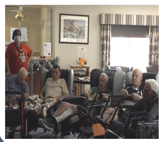
A MIX OF SONGS FROM CAROLS TO BUSH BALLADS